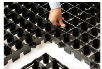
SCS Integra - Unfilled

The finished surface is free draining and acts as a Sustainable Urban Drainage Scheme (SUDs) and as such will not rut or puddle in all weather conditions.