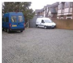
Day Centre - Milton Keynes