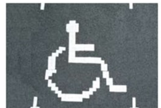
Disabled Bay in SCS Integra