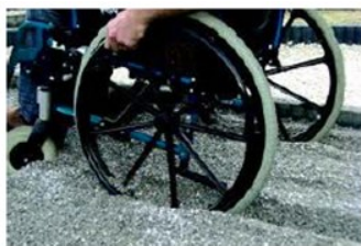
Without Gravel Reinforcement

Typically the units are installed over a sub base, geotextile layer (to prevent migration of the bed) and a bedding layer of either sharp sand or grit, an angular gravel (5-15mm) infill compacts into the cells without spreading and achieves an incredibly strong surface that is capable of supporting even very high loads. The stable gravel surface is suitable for use by wheelchairs and has been extensively used throughout the UK & Europe in many similar situations.