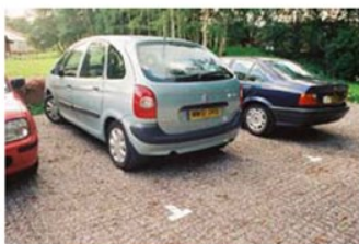
Hospice in Manchester