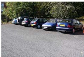
Birmingham Orthopaedic Hospital